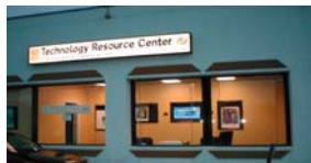
E-Gallery is ready for it's close up.

continue to be available and specifically targeted have been implemented. First, we have begun establish our sponsorship program. This will ing capability which we are now adding a new Second, we are preparing to help integrate technology into the basic operations of our member organizations to help stream line operations and increase efficiencies. Third, we are working to create practical programs with measurable outcomes that our member organizations can take advantage of to help their target populations to grow and improve their quality of life. Now that our preparation has been completed we have added to our DDN®, iN-Sourcing®, a web based support tool, a completed "Training Suite" which is a self contained suite of workstations dedicated to training solutions. This mix of resources and services form the basis of our set of proprietary solutions that can be a supplement to what our member organizations have in place and will allow them to help themselves and help others to compete in today's hi-tech environment. Our programs involve cus-